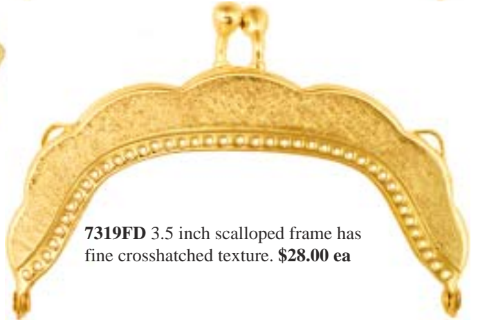
7319FD 3.5 inch scalloped frame has fine crosshatched texture. $28.00 ea

The lower edges of our hinged frames have holes so beadwork, leather, needlepoint or knitting may be stitched to the frame. Except as noted, all are available in Silver or Gold .