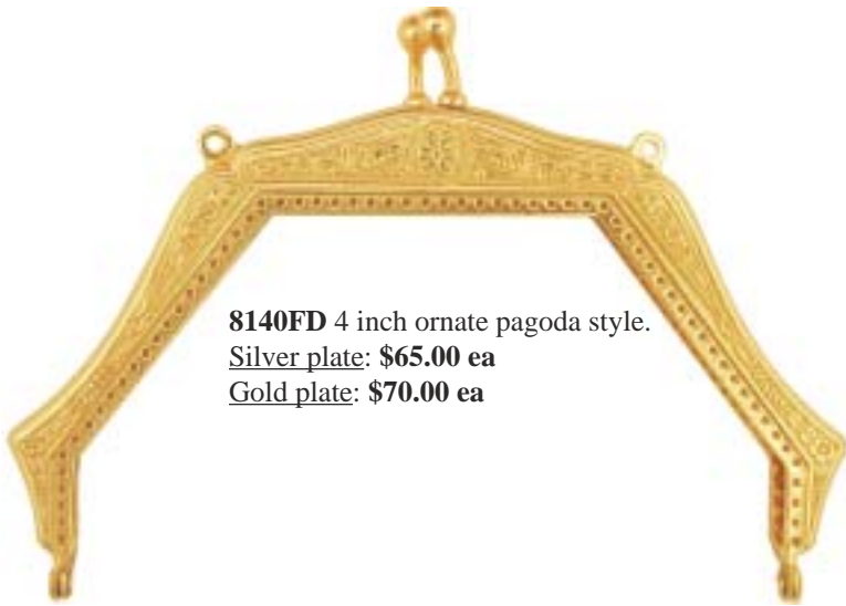
8140FD 4 inch ornate pagoda style. Silver plate: $65.00 ea Gold plate: $70.00 ea