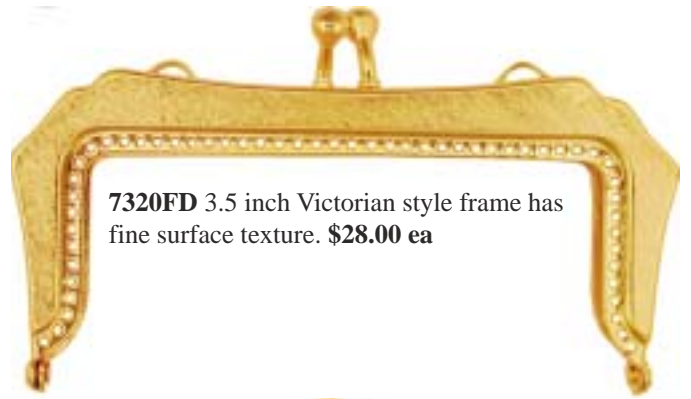
7320FD 3.5 inch Victorian style frame has fine surface texture. $28.00 ea